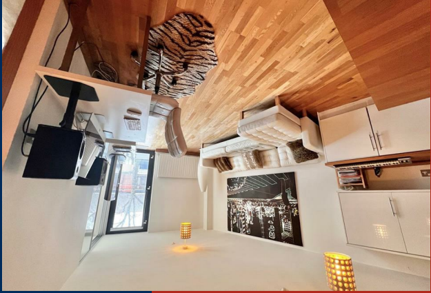
Lease Information AML